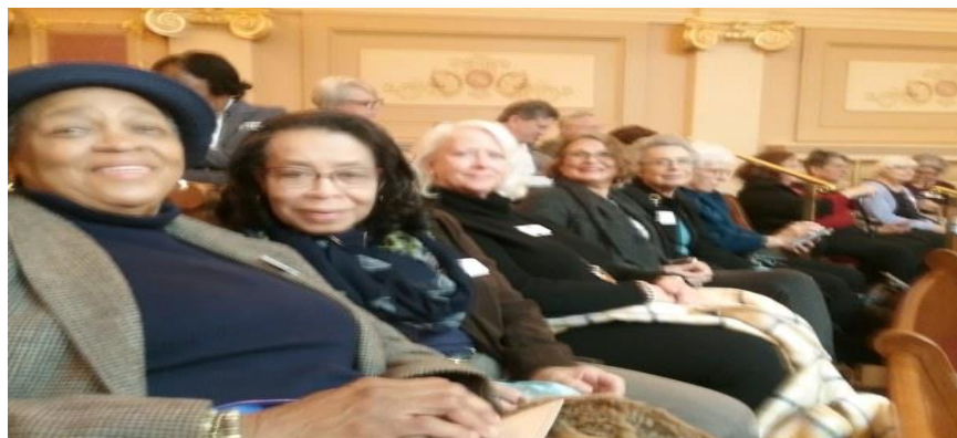
Virginia AAUW State Delegation for Lobby Day